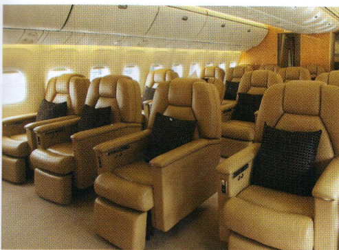
Comlux-outfitted 767 BBJ cabin.