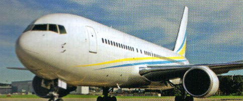
Comlux 767 BBJ.

The center also completes VIP charter aircraft for the Comlux Aviation Group. It now operates a charter fleet of 19 aircraft (one BBJ 767, two Airbus ACJ318, two ACJ319, one ACJ320, four Bombardier Global Express, three Global 5000, three Challenger 605, two Challenger 850 and one Dassault Falcon 900LX). It has another eight aircraft on order or in completion (one Airbus ACJ319, two Bombardier Global 6000, two Global 7000 and three Embraer Legacy 650).