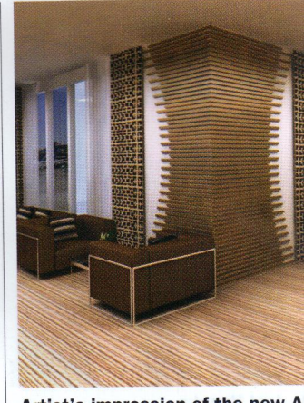
Artistic impression of the new

"People are becoming aware of the advantages of Abu Dhabi," he said. "The decision to revise our aeronautical charges last year and the introduction of a new instrument landing system has boosted traffic