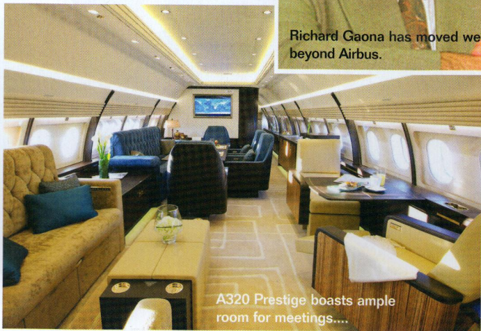
A320 Prestige boasts ample room for meetings....