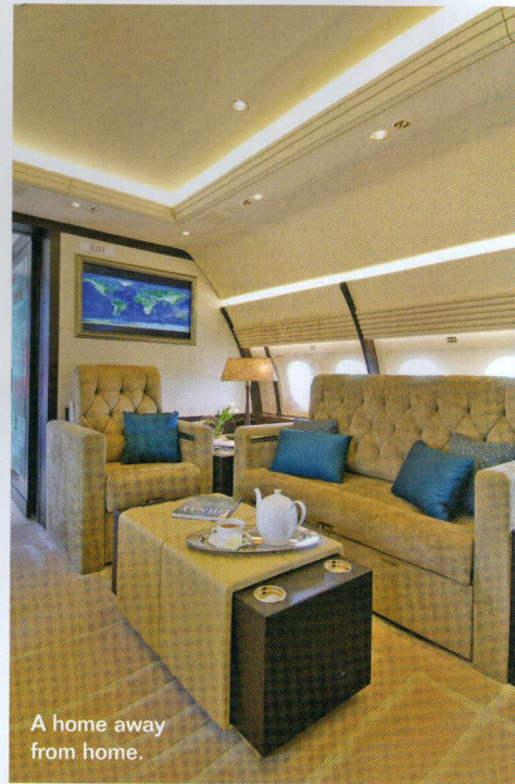
A home away from home.

Summing up, Gaona told ShowNews , "The CIS is booming, Europe is stable, which is good for us as we make a lot of flights to Europe, and we hope the Middle